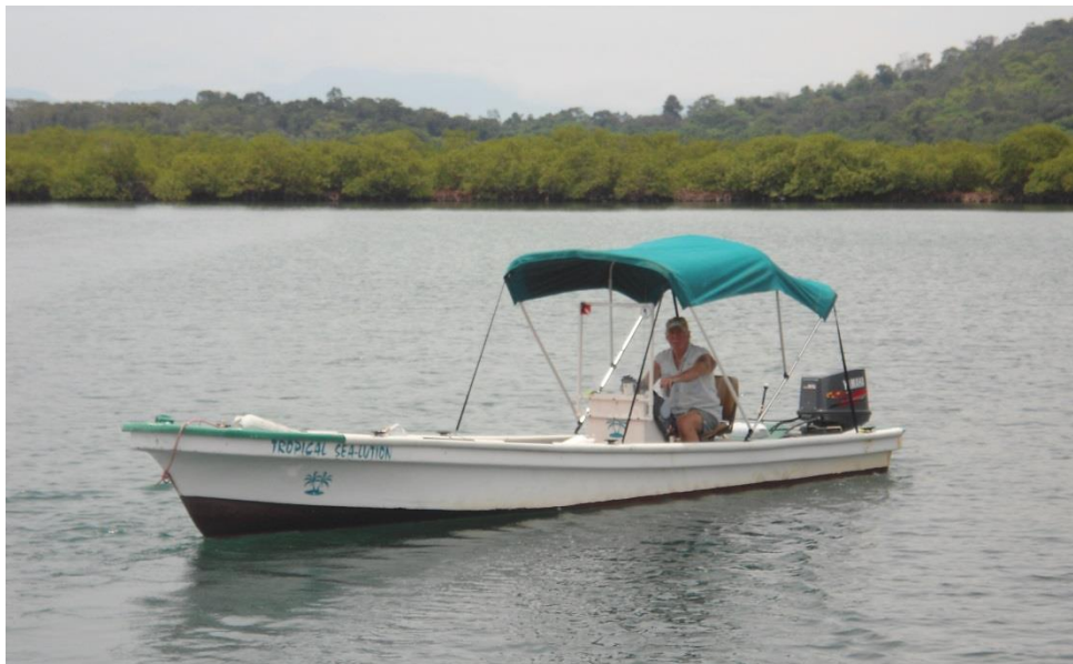
26 foot panga style boat with center console and 85 yamaha engine (included).