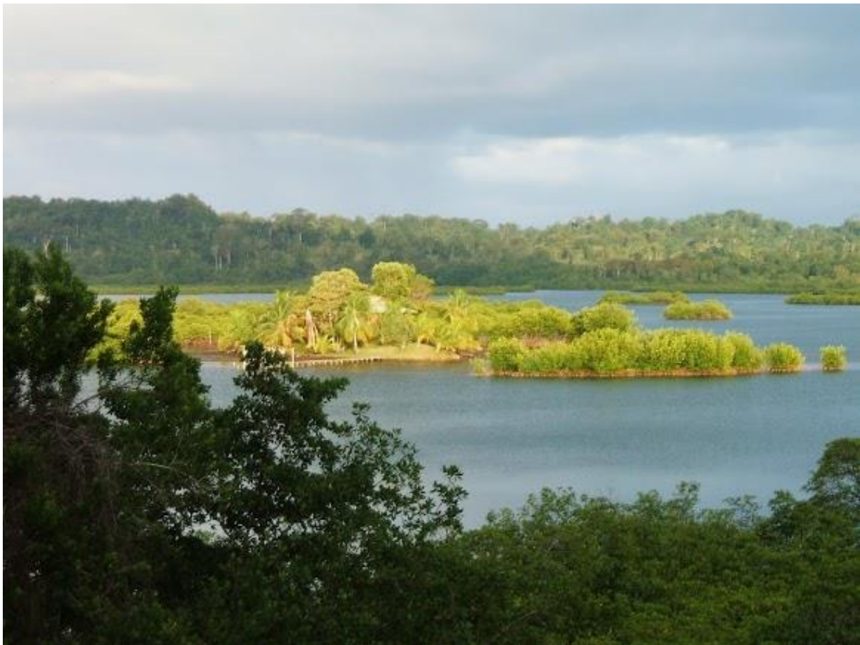
View of Isla Paloma from Saddle Hill, background shows Isla Popa and beyond that is Zapatilla Cayes and open ocean.