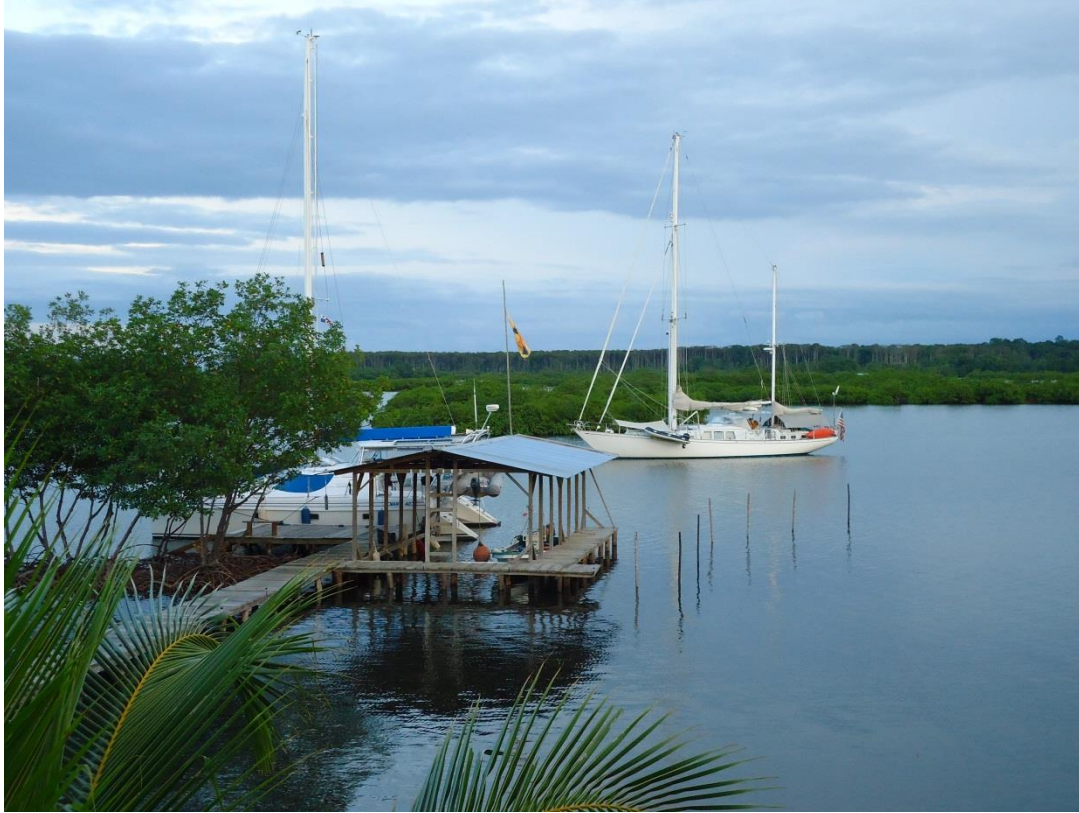
Deep water for anchorage